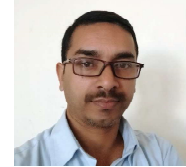
By: M.R. Lalu

The Congress in India has consistently been making a claim that the country should be beholden to the party as it had developed India into a Secular Democratic Republic. Probably, a political view about India in its journey as a country in the post-independence period would not legitimately deny this claim of the Congress. An excavation of the historic evidence and a reasonable assessment would reveal the fact that the party which had emerged as the harbinger of hope in India during the British colonialism could not manage to stay on the same track, re-emerging the diversity of India with unprejudiced acceptance for different religious faiths. The era began with the saffron rise in India has further complicated the importance of Congress, practically weakening the essence that the party desired to project it as; a secular political establishment with no lopsided approach to any religion and the only party with a capability to protect the quintessential - the secular India.