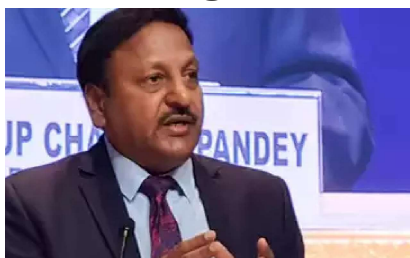
Chief Election Commissioner Rajiv Kumar

Over 4.9 crore voters, including 2.3 crore women, can cast their votes at 51,782 polling stations. Of these, webcasting will be done for 25,891 polling stations. There are about 4.61 lakh first-time voters in this election.